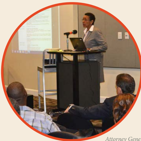
Attorney General Hon. Allyson Maynard-Gibson addresses the opening ceremony of the Environmental Law and Policy Conference held in the Harry C. Moore Library and Information Centre.

From oil exploration and aragonite mining to balancing environmental responsibility with development, the environmental issues addressed during the Environmental Law and Policy Conference held in June 2014 were compelling and diverse. The School of Social Science's Law Department hosted the conference in conjunction with Pace University, the Eugene Dupuch Law School and the Energy and Environment subcommittee of the Bahamas Bar Association.