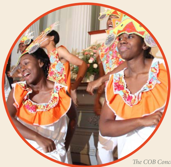
The COB Concert Choir performs in New York.