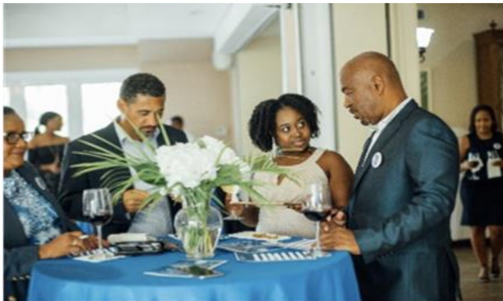
Hall of Famers Reception (2017)