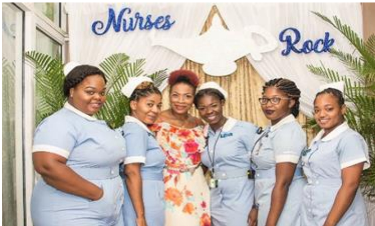
Nurses Alumni Mix & Mingle (Nurses Month, May)