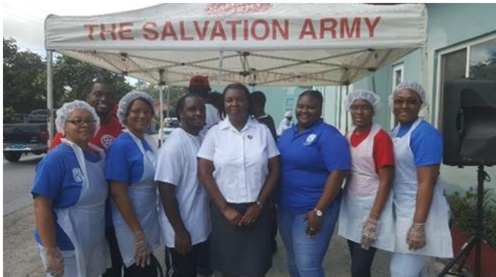
Community Service Partnership with Rotaract Club of UB (February)