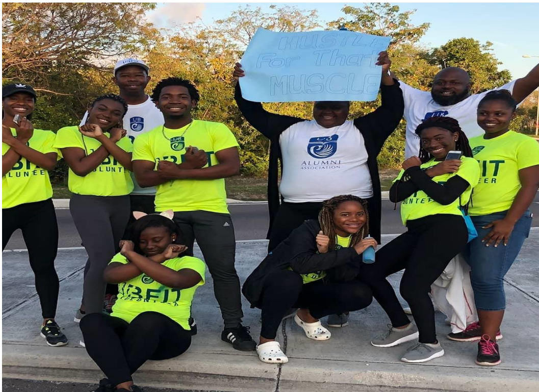
UB Fit with UB Dance Team (April)