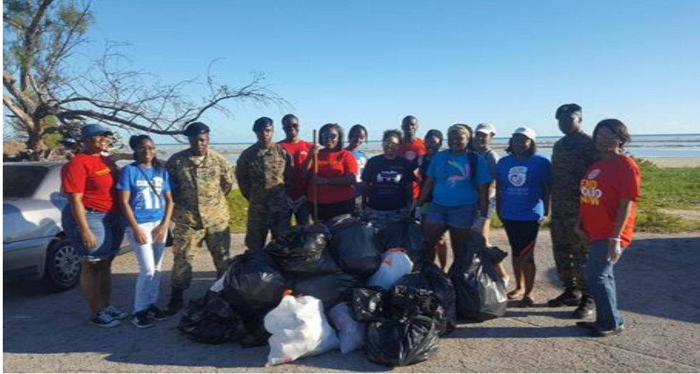
Beach Clean Up in Partnership with Rotaract Club of UB (February)