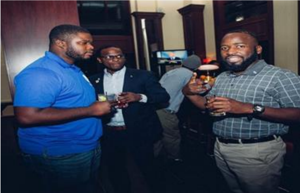
End of Year Mix and Mingle (December)