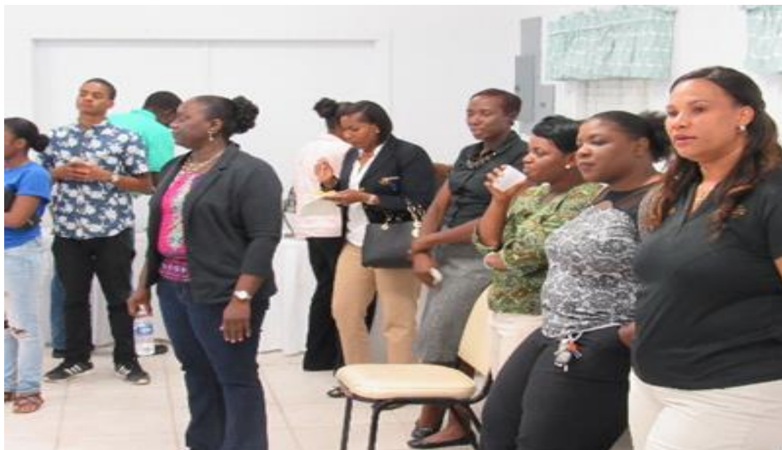
Exuma Mix & Mingle/Chapter Interest (February)