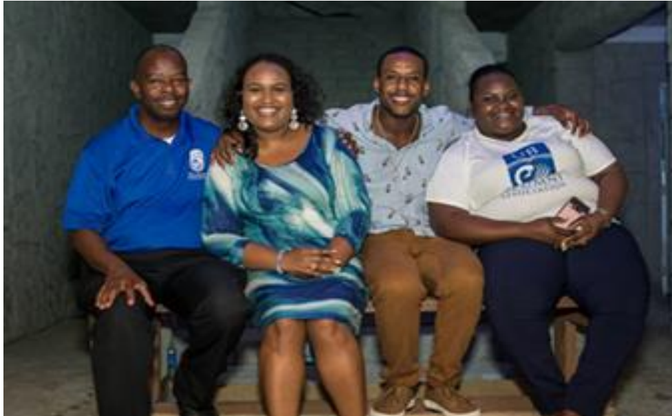
Graduation Party (May)