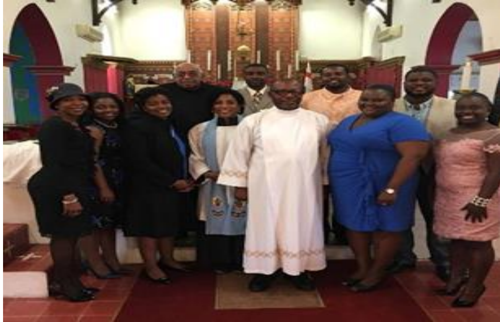
Church Visits (St. Mary's the Virgin Anglican Parish)