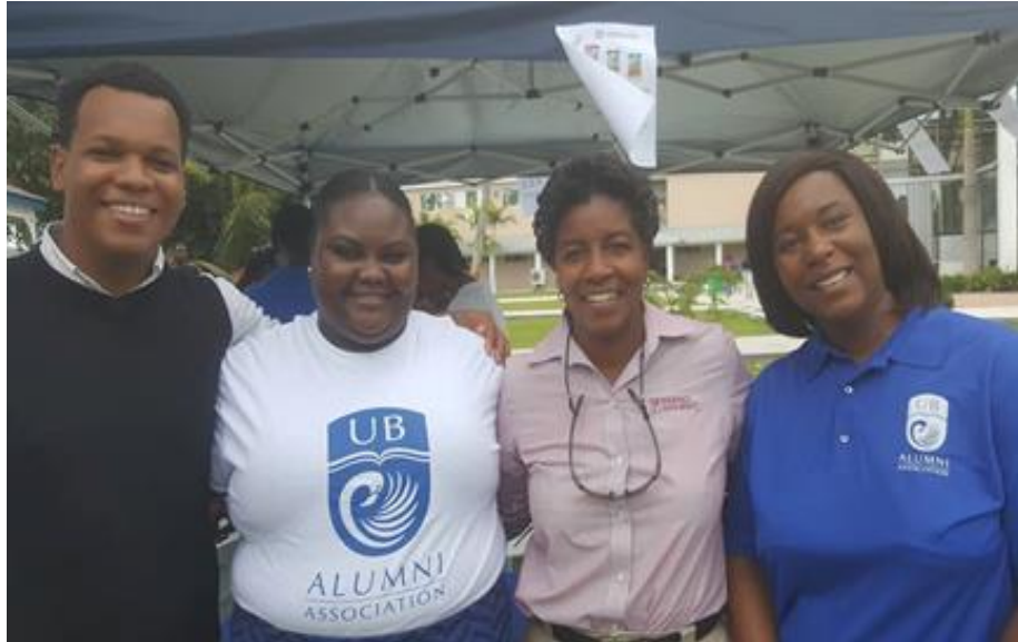
Supporting our Future Alumni via Campus Outreach (April)