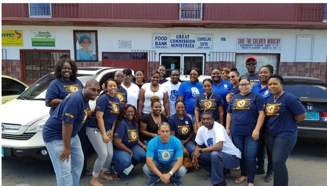
Community Service Partnership with Kiwanis Club of Nassau A.M (February)