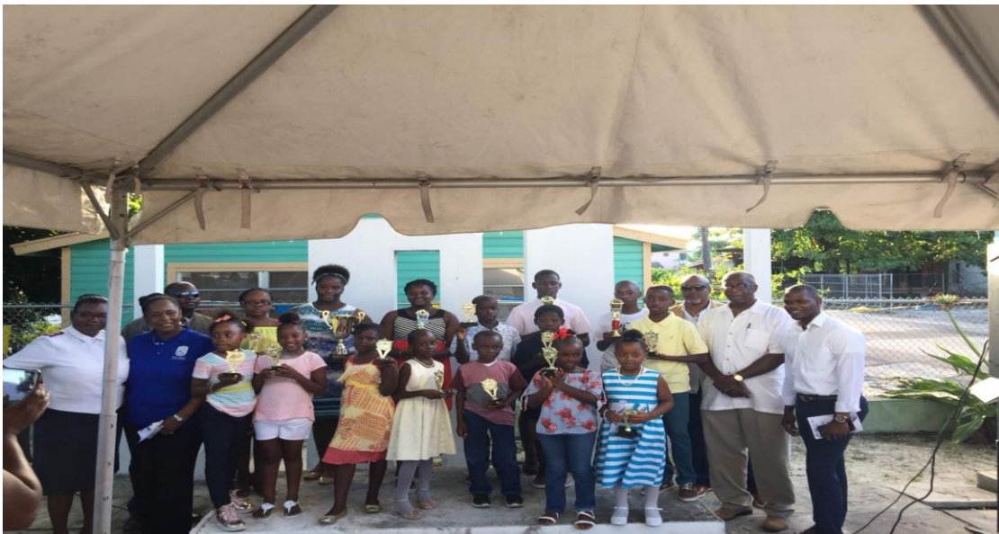
Community Service Initiative with Rupert Dean Lane Association in conjunction with the Bain Town Community (August)