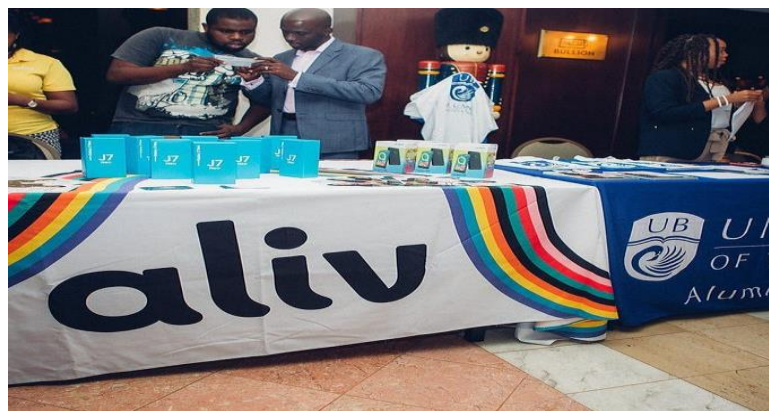
UBAA Affinity Program (October 2017)

1,000 direct members reached across various social media platforms