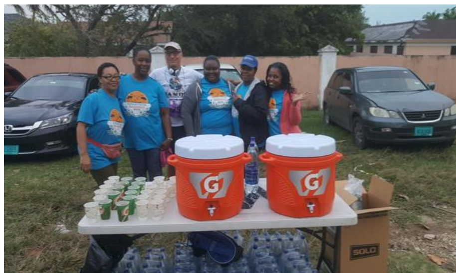
Annual Marathon Bahamas (January)