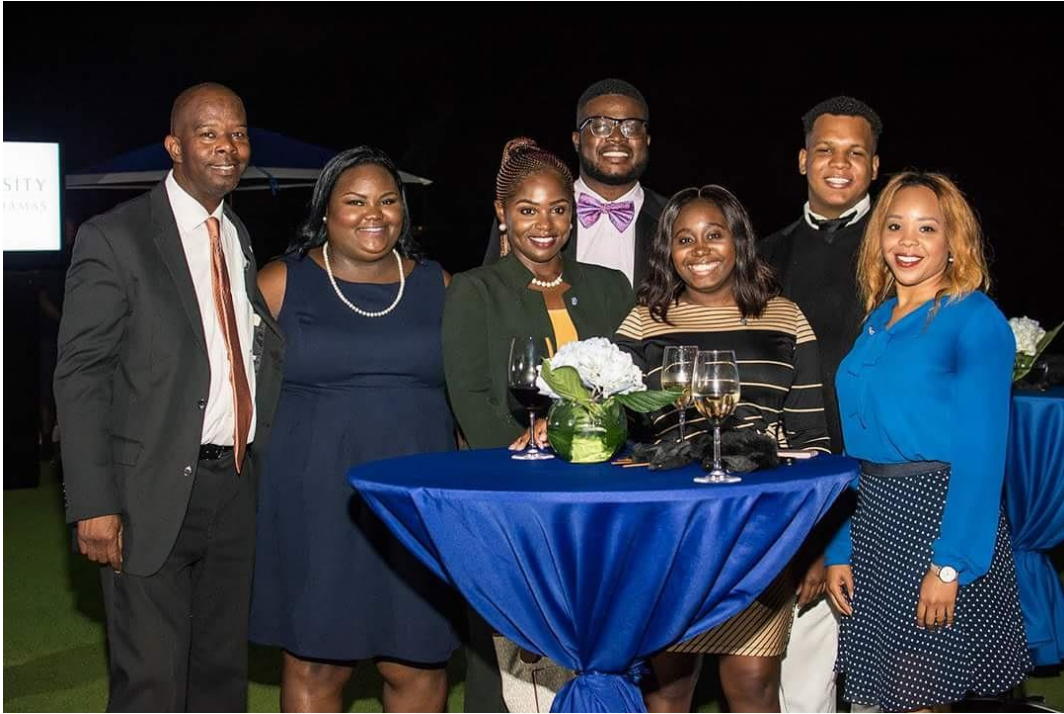
Alumni Parliamentarian Reception (May)